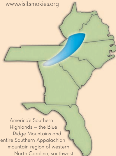
America's Southern Highlands – the Blue Ridge Mountains and entire Southern Appalachian mountain region of western North Carolina, southwest Virginia and eastern Tennessee